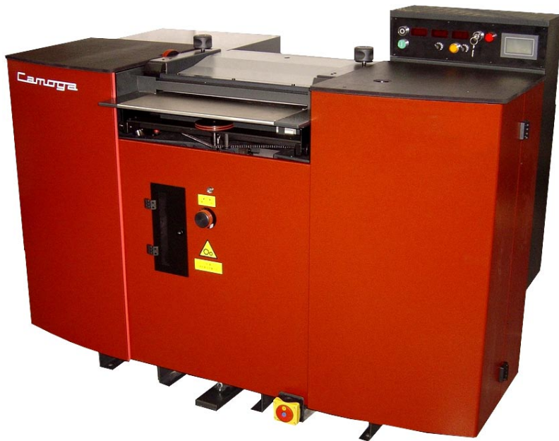
Machine with full options